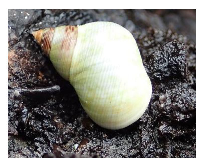
finding clusters of mostly yellow-green snails ranging from the size of a BB to ^{\sim} 20mm [ R ] throughout this driftwood "jungle.

Much of the surface of these weathered skeletal remains of pines and live oaks that was not exposed to the sunlight and was capable of retaining some moisture harbored up to several dozen of the snails, which were, in fact, "new."