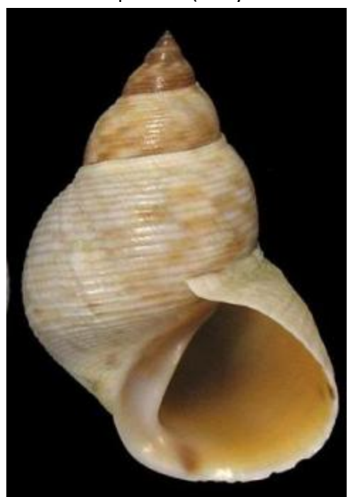
obtuse equal lines ... suture not indented ...

Phasianella nebulosa Lamarck, 1822 (p. 54) was described [R] from the island of Hispaniola (likely modern