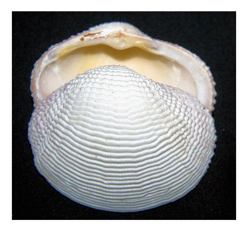
Fimbria fimbriata (Linnaeus, 1758) In shallow water/grasses, Philippines.