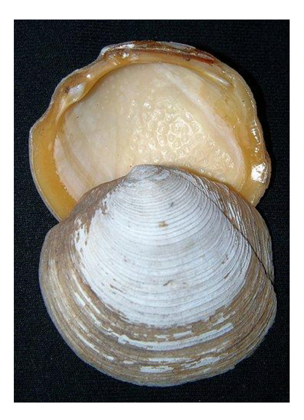
Lucina pectinata (Gmelin, 1791) From 1foot of water, Largo, FL, Gulf of Mexico, July,1979, Collected by Charlotte Thorpe

The Cretaceous mass extinction, which killed off not only the dinosaurs but also many forms of marine life, had little impact on the lucinids. Stanley writes that this can be attributed to the fact that the bivalves relied heavily on the endosymbiont bacteria for nutrition at a time when productivity of marine algae collapsed and many suspension-feeding groups of animals died out. About 500 lucinid species exist today, with by far the highest diversity in shallow-sea sea grass meadows.